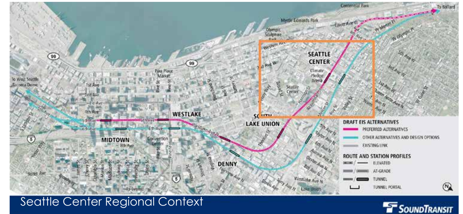
Seattle Center Regional Context

The charrette focused on the “preferred alternatives,” including the Seattle Center/Uptown station at Republican Street. The other alternatives were not discussed in depth at this session.