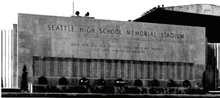
Memorial Stadium opened in 1947, Memorial Wall was dedicated in 1951

More than 50 years after its founding as a city department, Seattle Center is still the heart of the city. Through all these years it has remained agile – evolving and adapting as our community has grown and changed. Experiences at Seattle Center continue to touch us individually, knit us together as a community, and help us share our collective humanity. Like New York's Central Park or Millennium Park in Chicago, Seattle Center could become an iconic part of our city's identity.