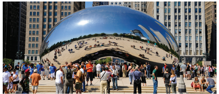
Anish Kapoor's Cloud Gate at Millennium Park