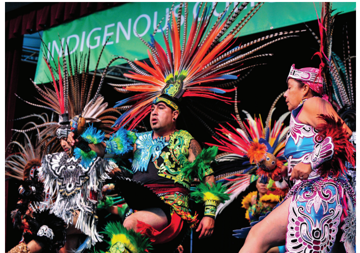
Festál: Spirit of Indigenous People

Seattle Center also partners with dozens of community-based cultural groups to produce programs like Festál. Through events drawing on the world's cultural traditions, these programs support and enhance cultural stewardship, innovation, and creativity in diverse neighborhoods throughout King County.