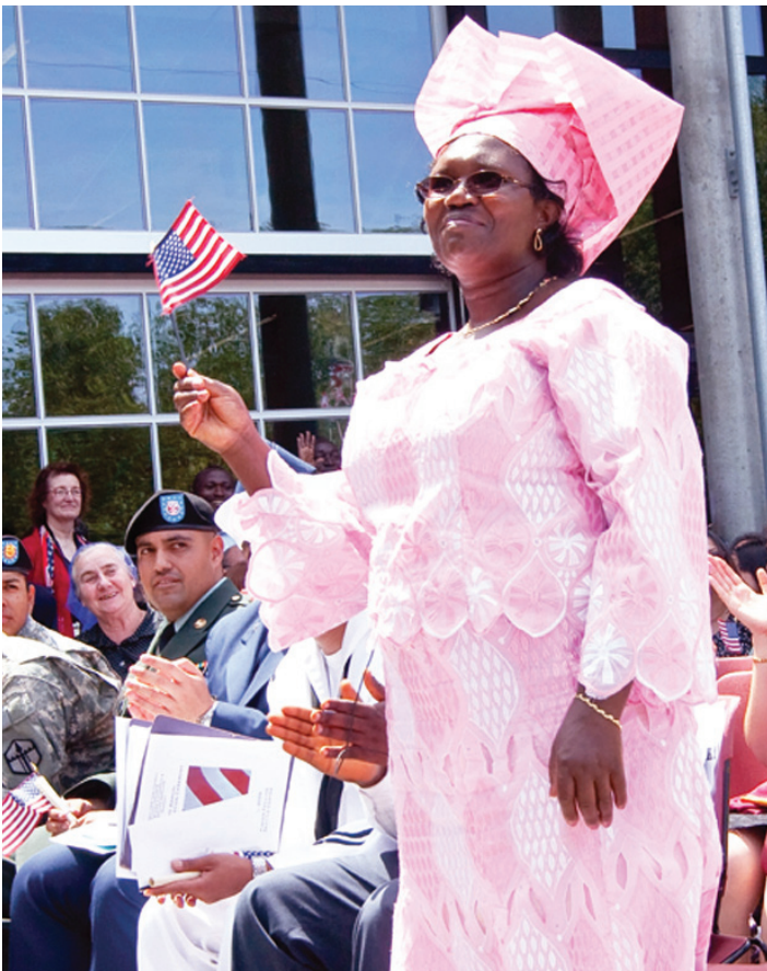
Naturalization Ceremony for U.S. Citizens