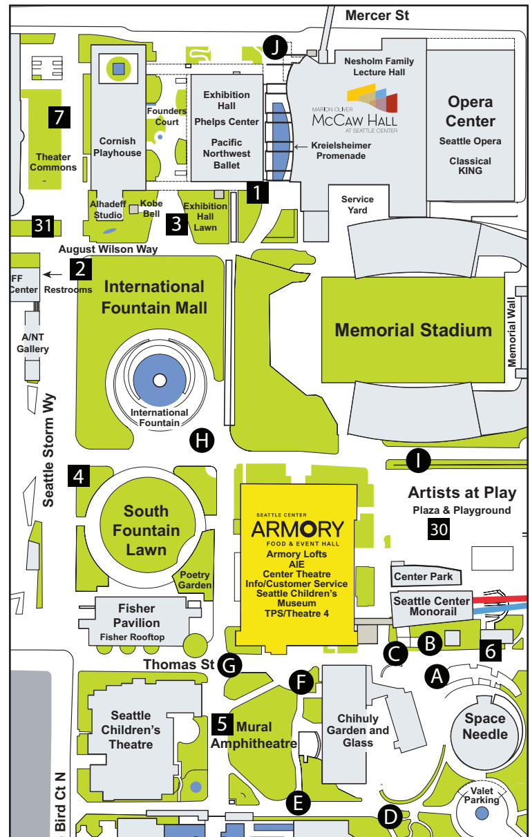
Full Campus Map on Reverse Side

All activities shall follow the Rules of Conduct as defined in the Seattle Center Campus Rules which are available from Customer Service, Seattle Center Armory, 305 Harrison St, Seattle, WA 98109 or online at seattlecenter.com/visitor-info/campus-rules